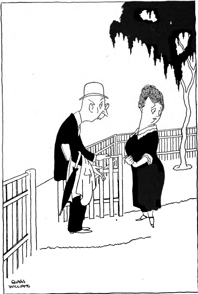
She would turn away and bite her lip.